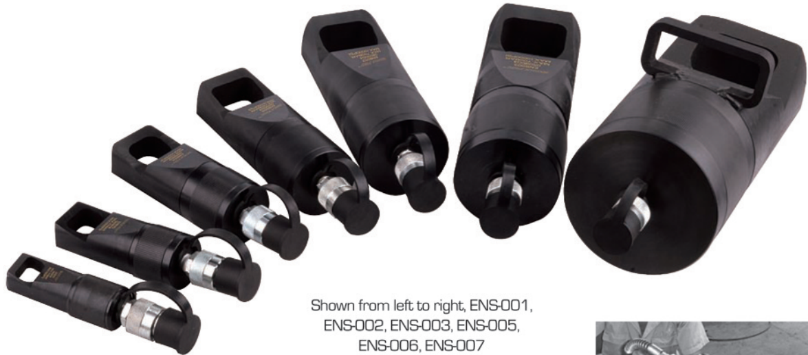
Shown from left to right, ENS-001, ENS-002, ENS-003, ENS-005, ENS-006, ENS-007