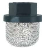
AP8656-1 (AP860.1A 3/4")