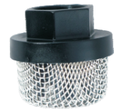
AP8656 (AP860.1B 7/8") • Fit for 470, 488, 520.