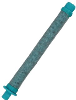
AP8645-1 (RP860.3) • 50 mesh, 100mesh, 150mesh available. • Titan graco sprayer.