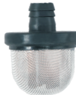
AP8656-4 • Fit for AP8620, AP8622, AP8623, AP8624.