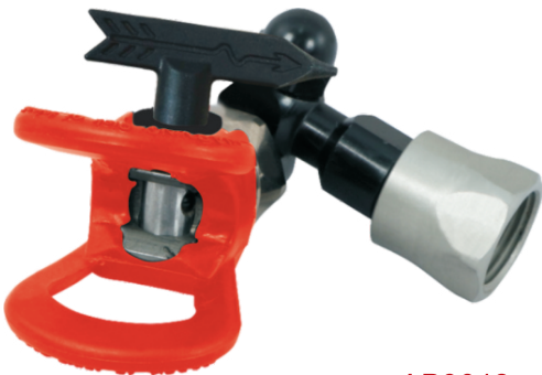
AP8642 • 270° rotation tip guard.