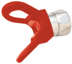
AP8647-1 • Stainless steel