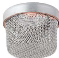
AP8656-3 (R45.8.1) • Fit for R45.