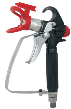
Two finger trigger