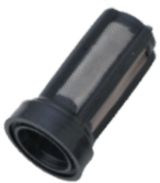
AP8644 (RP816.6) • Filter for airless sprayer 60 mesh, 100 mesh available.