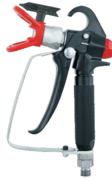
Four finger trigger