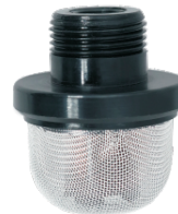
AP8656-2 • Fit for AP8619, AP8618.